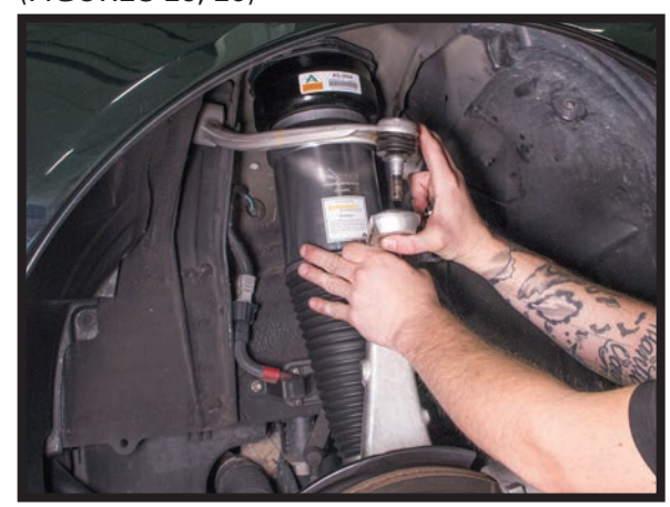
FIGURE 25 REINSTALL THE COTTER PIN. (FIGURE 27)

4. RECONNECTTHE UPPER BALL JOINT AND TIGHTENTO MANUFACTURER'S SPECIFICATIONS. (FIGURES 25, 26)